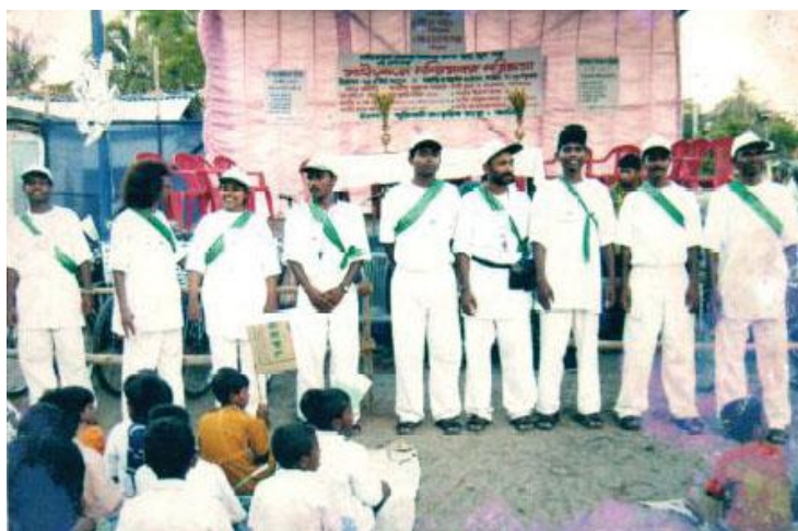
Going around West Bengal on bicycles, campaigning on snakebite awareness, 2007