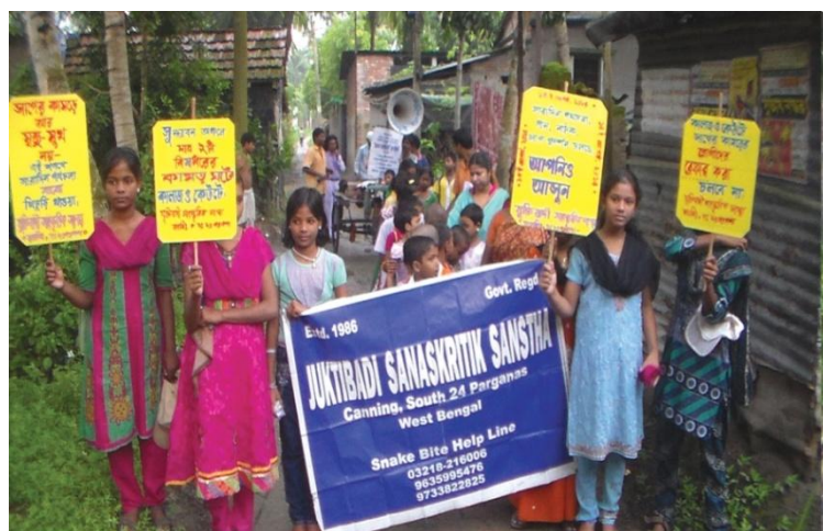
10 Kilometer road show on 15th August, campaigning on snakebite awareness, 2013