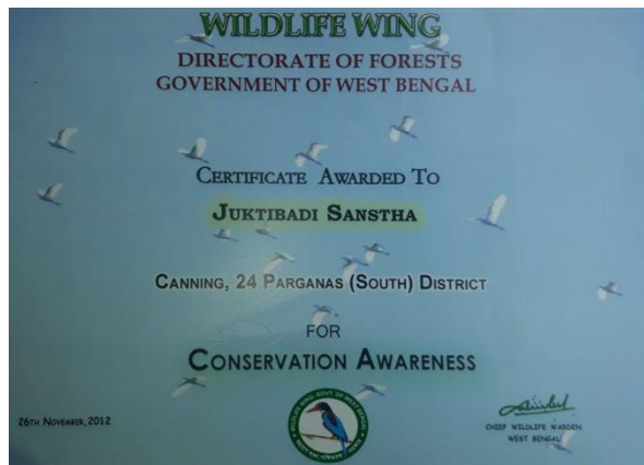
JSSC received Conservation Awareness Award from the Directorate of Forests, WB Govt. - November 26, 2012